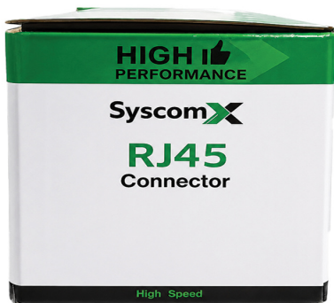
Side Box View