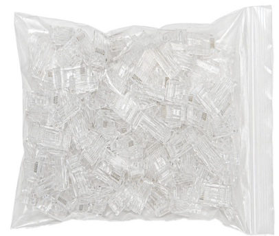
100 PCS Connector Bag