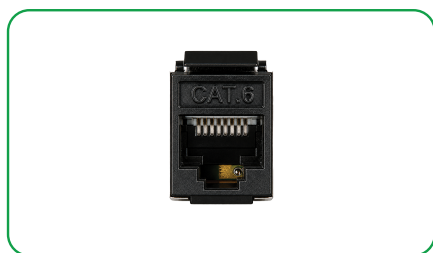
Front RJ45 Port